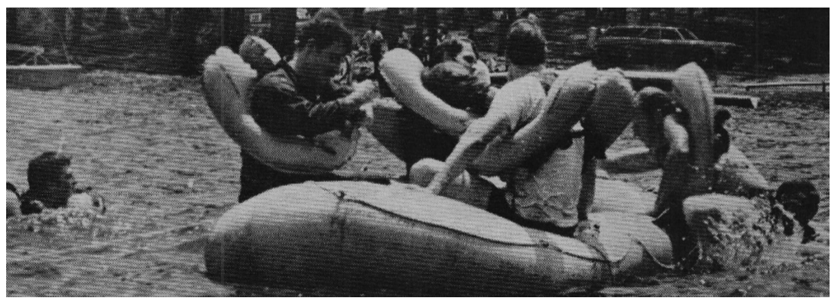
Flight crews of the 700 TAS participated in annual "Wet Ditching" exercise training for emergency procedures in the event of bailout over water. The training exercises were conducted during the summer encampment by personnel of the Survival Equipment Section of the 918 Tactical Airlift Group. An orientation explaining bailout procedures began the exercises followed by demonstrations in the use of flares and survival kits included in the different types of rafts. At the conclusion of the lecture portion, each flight crew member swam to each of the various rafts positioned in Lake Allatoona to perform the required entry and setting up of raft equipment. This portion of the exercise included swimming to a one-man raft, then to a six-man raft and then to the 20-man raft. Crewmen then were required to set up and work with the equipment provided in each raft and simulate the actual use of the survival equipment. 1973