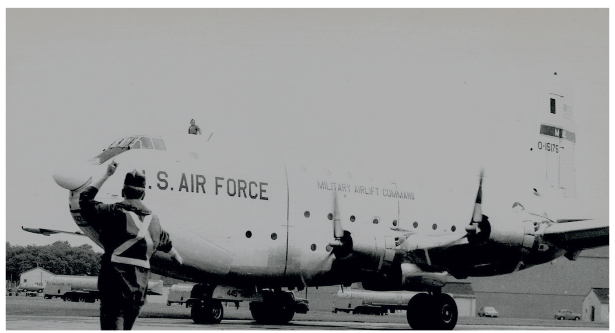
700 MAS C-124 taxis into parking spot at RAF Mildenhall on 8 July 1968. .