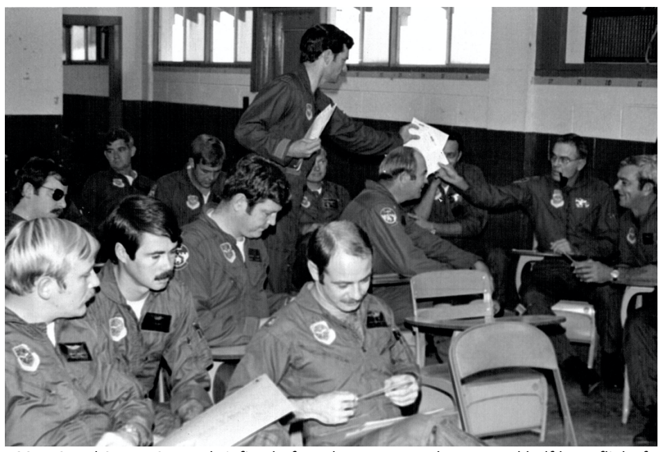
700 TAS and 357 TAS crew briefing before departure on the one and half hour flight from Gulfport, MS to the Eglin AFB, FL landing zone. 1977

Nov 1977 he 94 provided six aircraft and 190 personnel for "Bold Eagle." a 20,000 troop U.S. Readiness Command exercise held during November. The aircrews delivered thousands of pounds of supplies to aggressor forces.