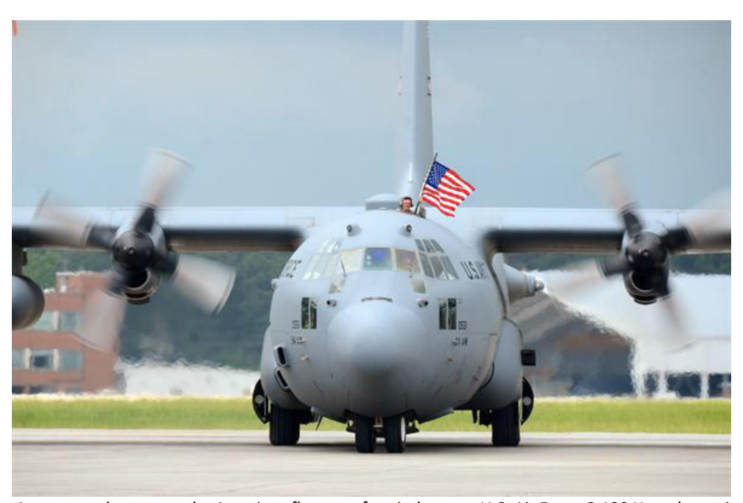
A crewmember waves the American flag out of a window as a U.S. Air Force C-130 Hercules taxis down the flightline returning to Dobbins Air Reserve Base, Ga. after its five month long deployment May 18, 2015. More than 150 members from the 94 Airlift Wing deployed to support the Central Command Area of Responsibility earlier this year.