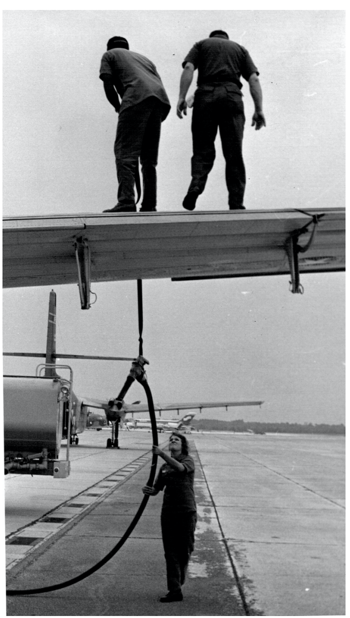
C-7 refueling prior to the day's activities during Exercise Bold Eagle. 1977

1977 Exercise Bold Eagle utilized many of the pilots and crew members during this reporting quarter (report on Bold Eagle precedes). One C-7 aircraft was deployed to Hill AFB, UT, in October. The purpose of this mission was to provide assistance to the 508th Tactical Clinic (Reserve), Hill AFB. This clinic conducts a yearly "mercy mission" providing medical assistance to children from the Navaho Indian Reservation in Blanding, UT, and surrounding areas. Because of the weight restriction on Blanding's runway and the need to transport personnel and supplies over rough, mountainous regions, the caribou was the only available aircraft capable of providing this assistance.