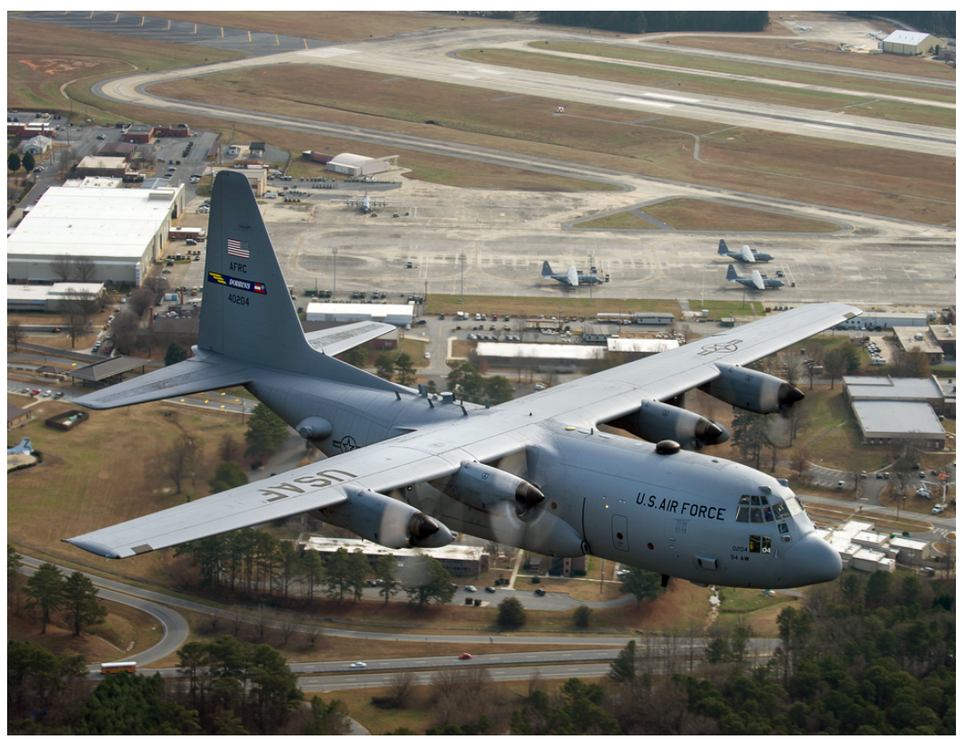
700 AS C-130 flying over Dobbins.

8/1/2013 -Forty-eight Airmen from the 94 Airlift Wing traveled from Dobbins Air Reserve Base, Ga. to Edmonton, Alberta Canada last month to participate in Maple Flag 2013, a multi-unit international exercise sponsored by the Canadian Armed Forces and Air Combat Command. The C-130 aircrews deployed, planned, employed and debriefed with foreign military personnel. Participation was, by and large, due to initiative taken by Airmen within the 700 Airlift Squadron. "Maple Flag provided invaluable training for the wing," said Master Sgt. Jeffery Botz, 700 AS loadmaster. "The vast majority of aircrews we sent to Canada have been flying less than five years and had yet to train in a full NATO scenario. This presented a unique set of challenges with equipment compatibility and language barriers. However between aircrews' experience, ability to work well and take initiative, we were able to ensure everyone had the proper information to execute the mission."